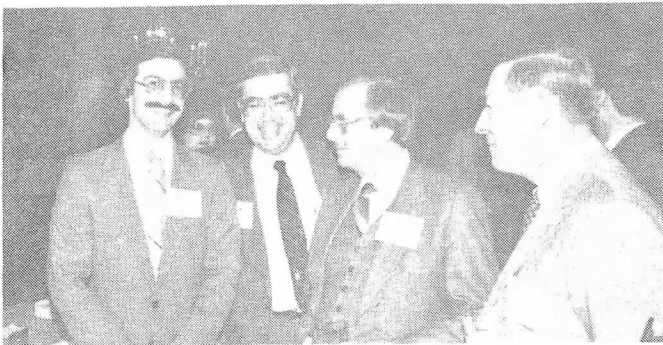
Scenes from the Regional Officers Conference