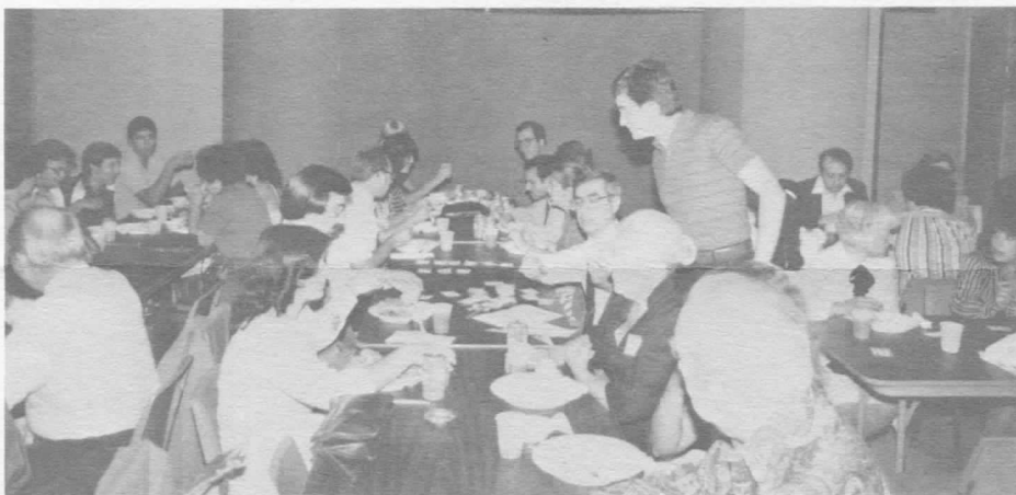
A well-earned buffet break!