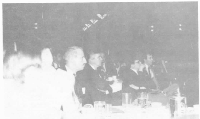
Some of our members at the May 10th meeting watching a mock jury in action.

P.O. Box 1499 Philadelphia, PA 19105 - 1499 (215) 592 - 9959