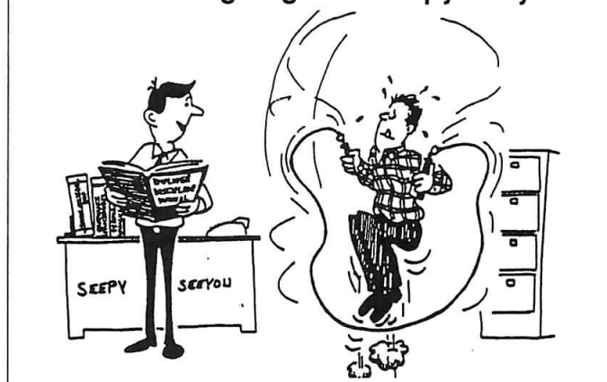
Since this market always keeps us hopping we thought it would be a good idea to have all our employees go through this test.