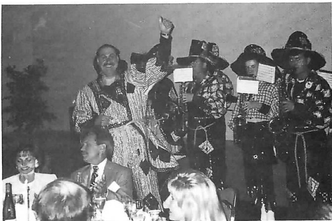
Some of the Quaker City string band members entertained CPCU officers from around the region at the COLC held in Philadelphia April 30-May 2.