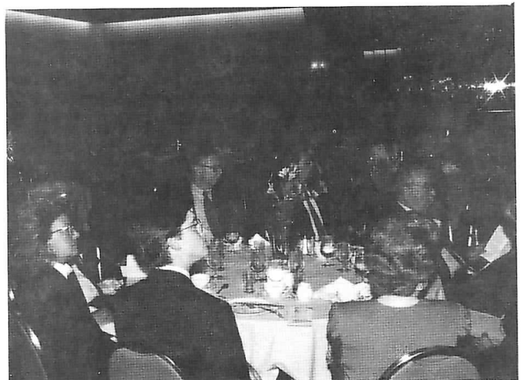
Some of the attendees at our May meeting on alternative dispute resolution.