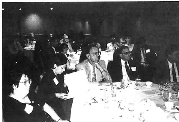
Some of our members at the June Meeting on international insurance.