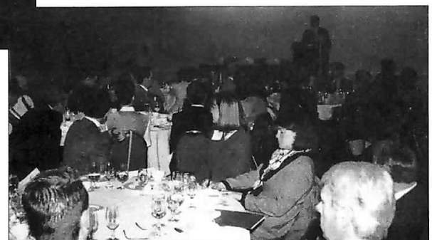
Some of the members at our Meeting on Sexual Harassment.