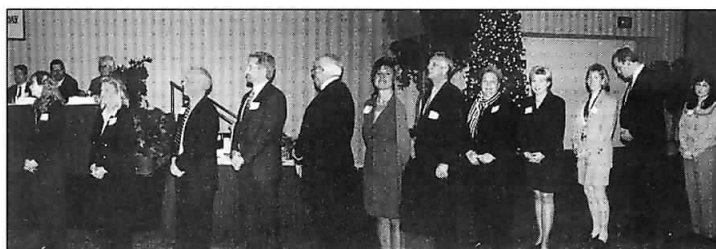
These 12 New CPCU Designees from the class of 1999 received diplomas and recognition at the December 8, 1999 Philly I-Day luncheon ceremony.