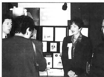
PIA of PA, DE and MD had their booth and staff at the 1999 I-Day.