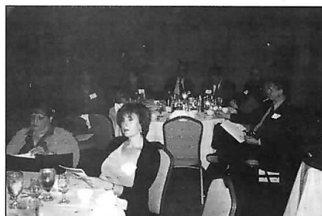
Some of those attending the June meeting