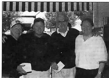
Thanks for a great day and cause