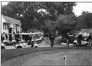
"Gentleman Start Your Engines"

On 5/18/01 the 3rd annual CPCU Scholarship Golf Outing was held. The weather was threatening but the Die-hard Golfers forged ahead. We had a full field setting the scene for next year's event to become a full club Shotgun.