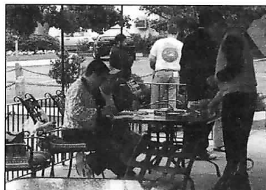
Prepping for the sign-in