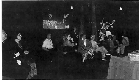
Some of the many that attended the Candide social.