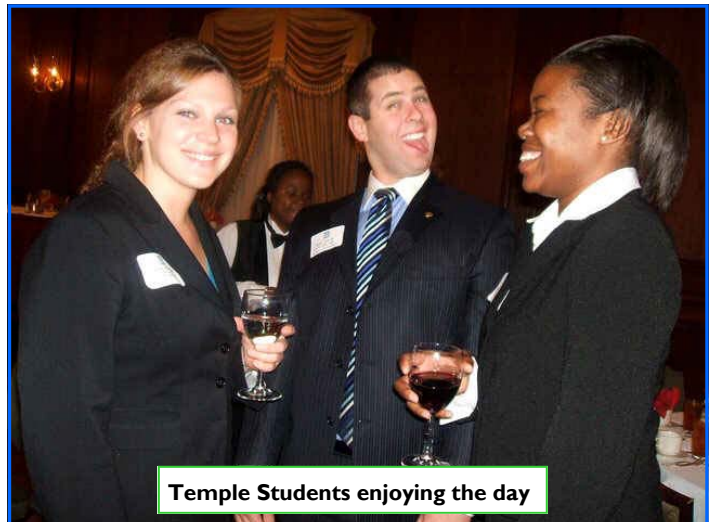
Temple Students enjoying the day