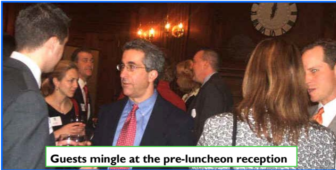
Guests mingle at the pre-luncheon reception